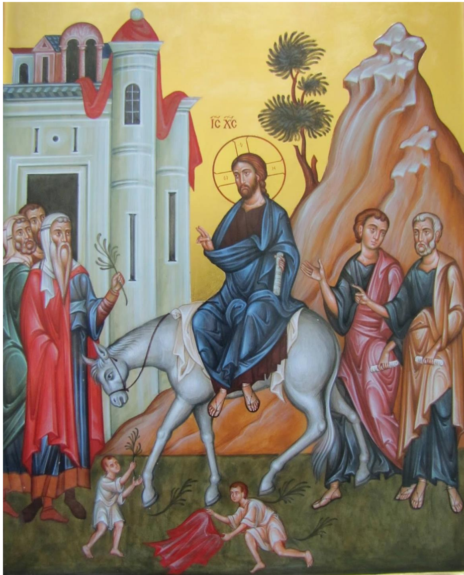
Christ's Entry into Jerusalem