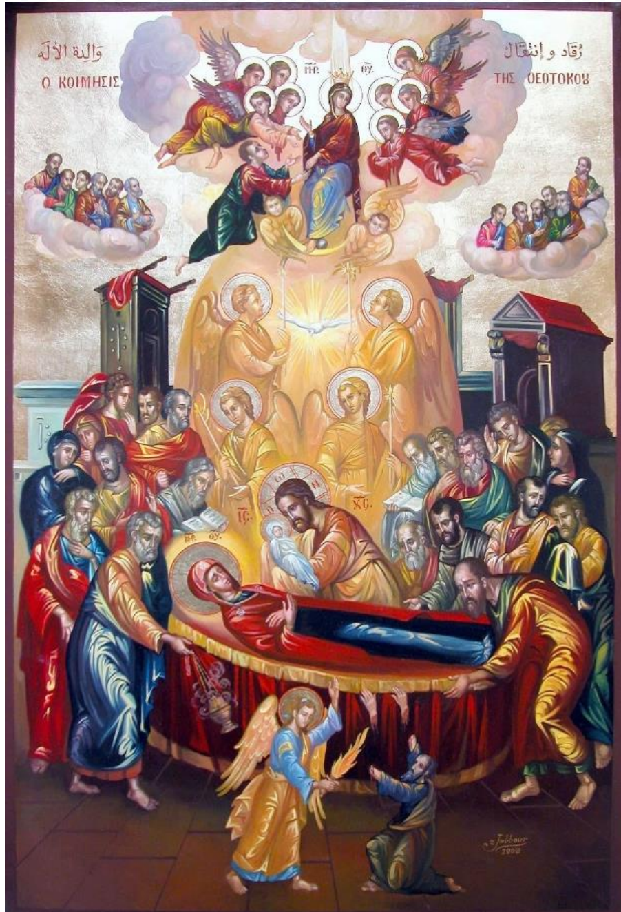
The Dormition (Kimesis) of the Virgin Mary