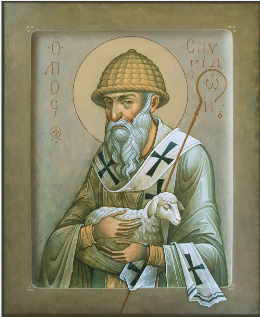
St. Spyridon the Wonderworker