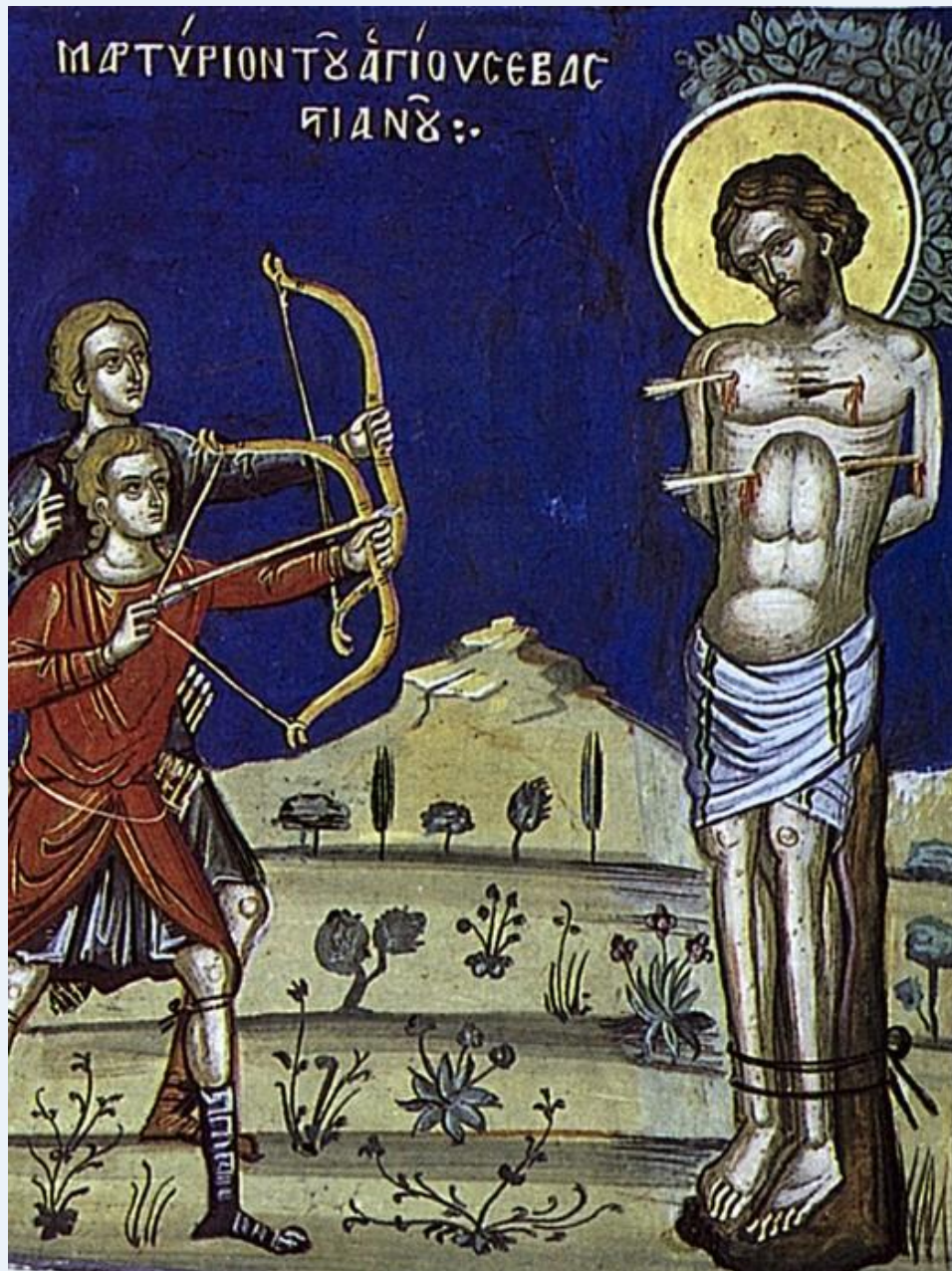
St. Sebastian the Martyr