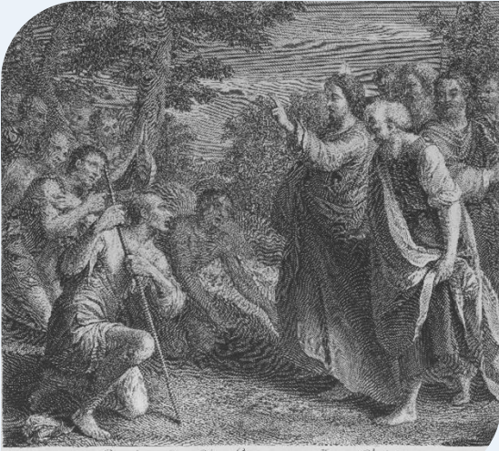
Guérison des dix Léprieux par Jésus-Christ. D'après le Tableau de l'Académie de Saint-Cyr, pour servir de base à la même grandeur au

You cleansed the lepers and cured the lame. You healed the paralytic, the woman with a hemorrhage; You walked dry-shod upon the waters, showing Your glory to Your Apostles, O Lord. – From the Pentecostarion