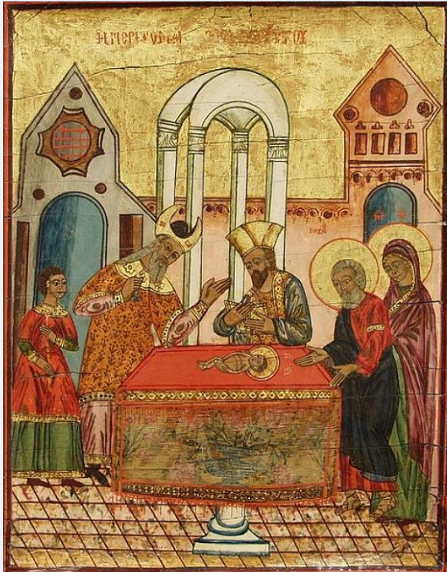
Circumcision of our Lord on the Eighth Day