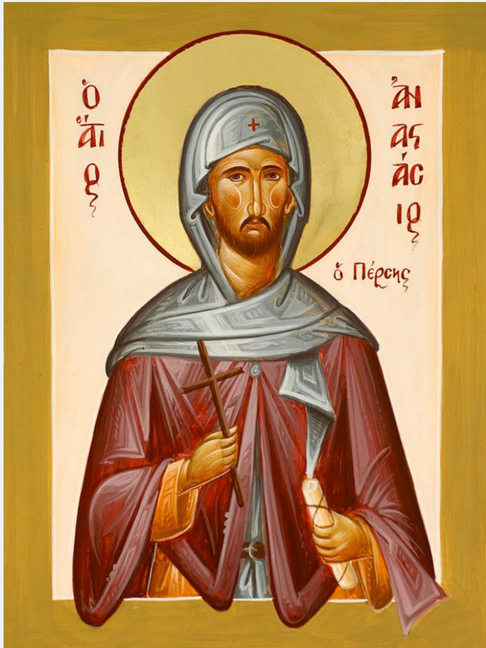
St. Anastasios the Persian