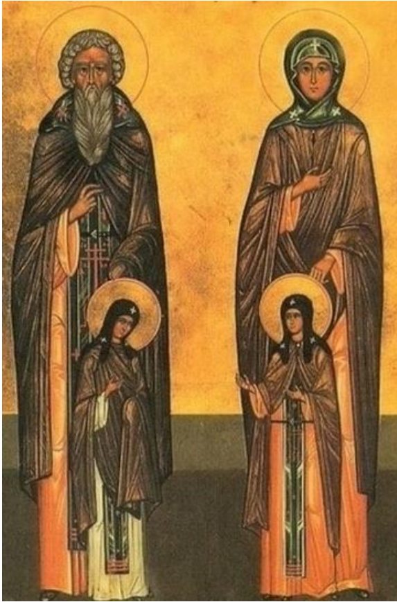
St. Xenophon and His Family