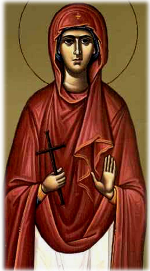
St. Anna of Leukadio