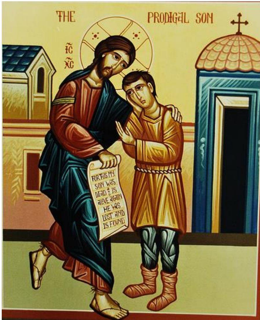
The Prodigal Son