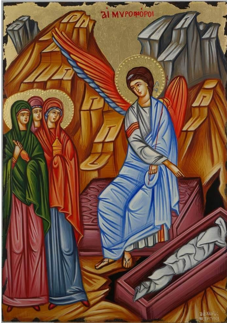
THE MYRRH-BEARING WOMEN

CHRIST IS RISEN! ~ TRULY, HE IS RISEN! ΧΡΙΣΤΟΣ ΑΝΕΣΤΗ! ~ ΑΛΗΘΩΣ ΑΝΕΣΤΗ!