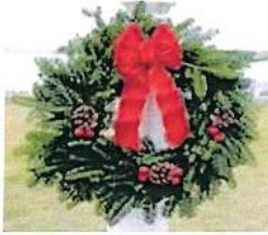
Fresh Balsam Fir Holiday Wreaths with Pine Cones, Berries and Red Velvet Bow