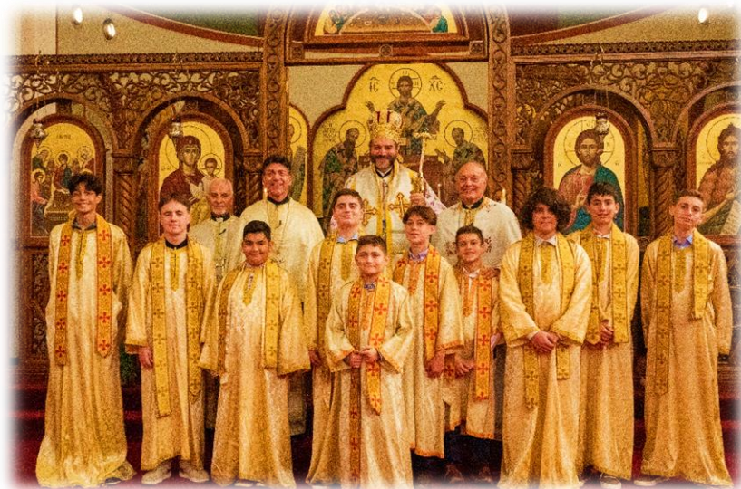
Holy Trinity Altar Boys Tonsuring - ΑΞΙΟΣ

Greek Orthodox Metropolis of New Jersey 215 E. Grove Street Westfield, NJ 07090