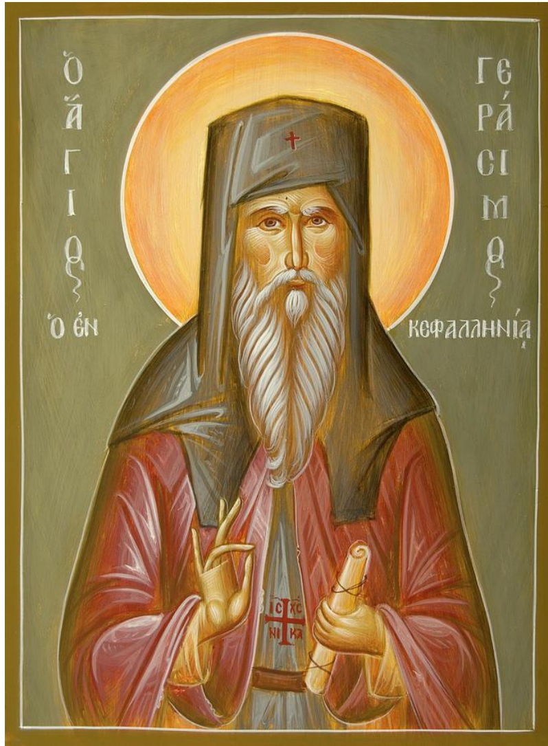
St. Gerasimos of Kephallonia