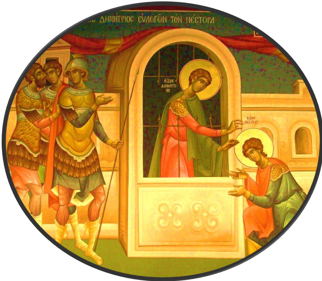
ST. DEMETRIOS THE GREAT MARTYR