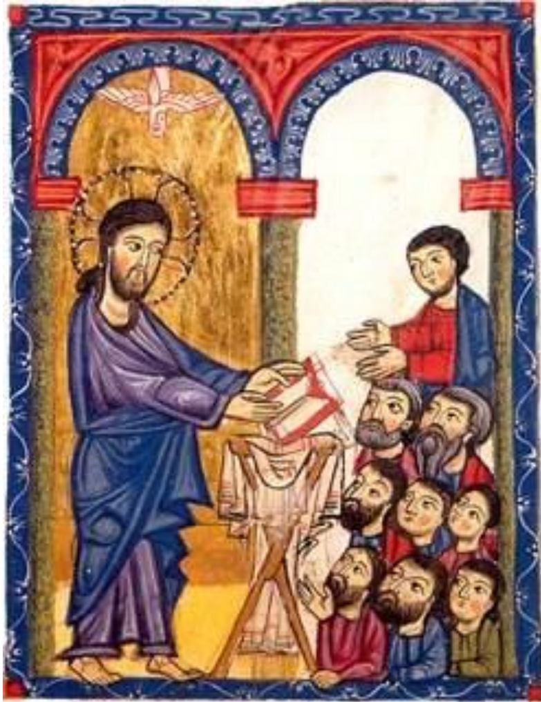
Christ Propheing Concerning Himself