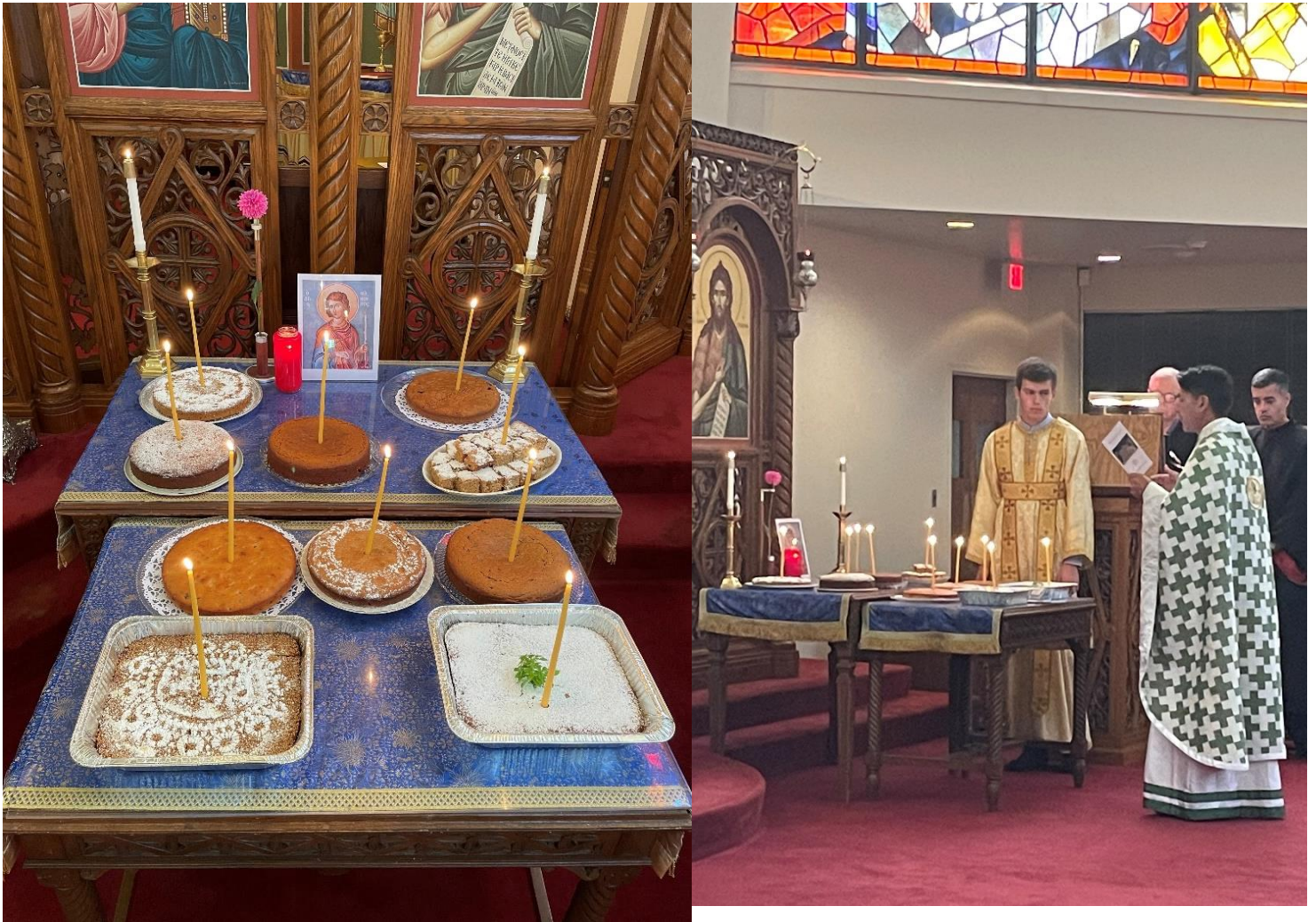
The Blessing of Phanouropites at Holy Trinity

Last Sunday, it was such a beautiful sight seeing so many Phanouropites offered in honor of St. Phanourios. We thank everyone who brought and offered these delicious cakes. Enough Phanouropites were brought that we even had a nice coffee hour to share, taste, and test each one of them.