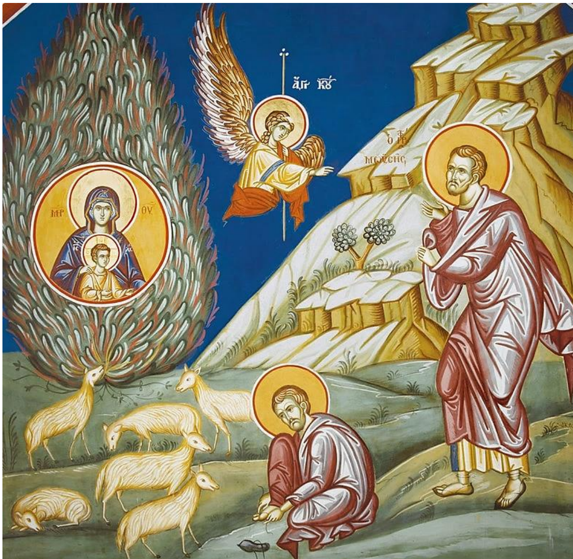
The Holy Prophet Moses