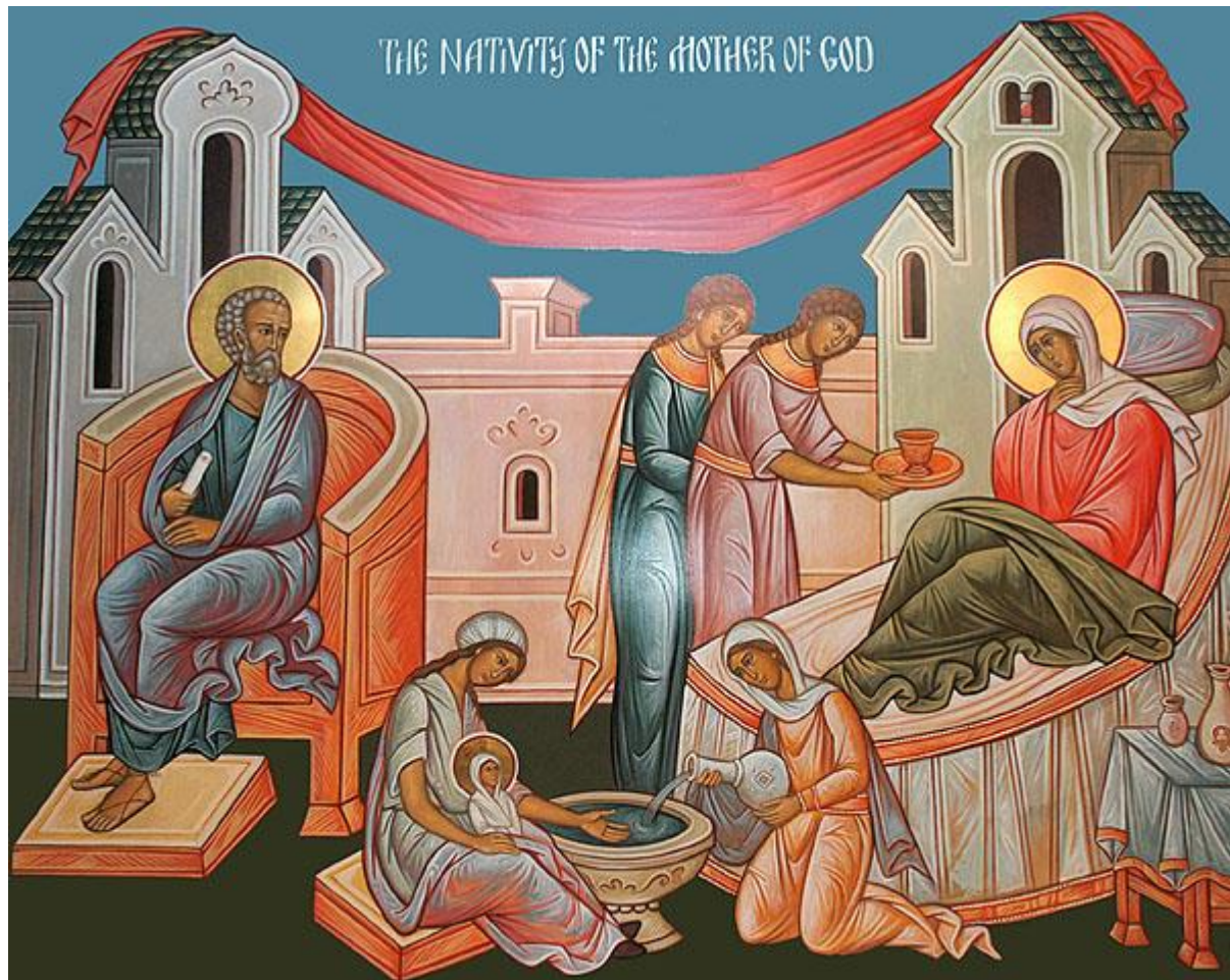
The Nativity of the Theotokos and Mother of God