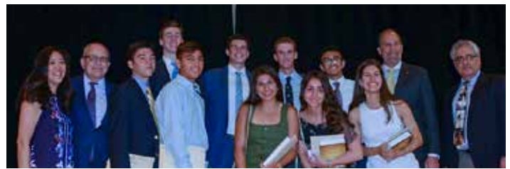
Holy Trinity Seniors