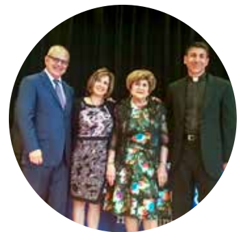
Philoptochos Scholarship Committee