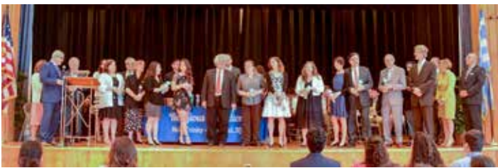
Sunday School Teachers