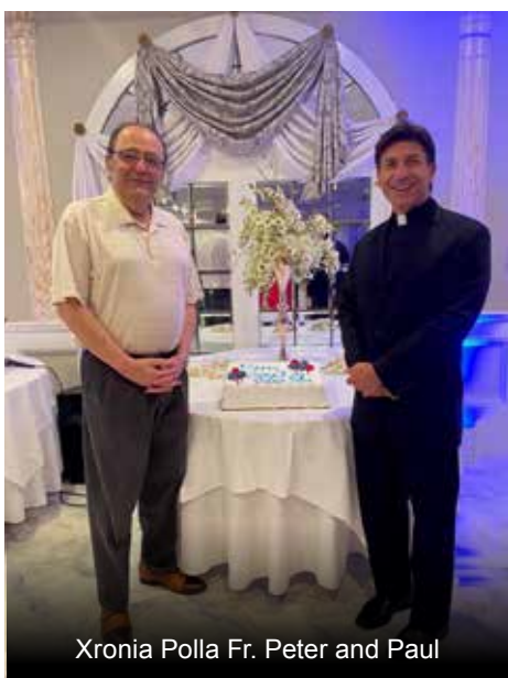
Xronia Polla Fr. Peter and Paul