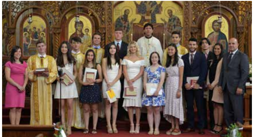
2020 Graduating Class