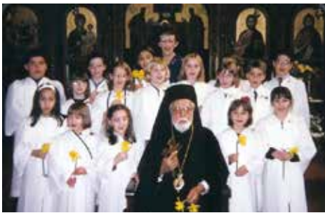
Archbishop Iakovos with Angel Choir 2000

The pictures here presented represent a short history of our Youth Choir that is called the Angel Choir (ages 7-12) and Byzan-“teens” (ages 13-18). The Angel Choir started in 1992 to sing along with our Adult Choir. A few years later, a generous parishioner donated new white robes. This group rehearsed after Religious Education classes for about 30 minutes. As you can see, Archbishop Iakovos visited Holy Trinity in 2000 and admired the angelic voices. During the distribution of antidoron, His Eminence, of blessed memory, requested that the Angel Choir stand near