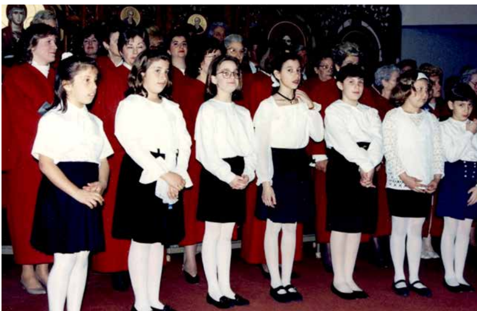
Angel Choir 1994 before white robes