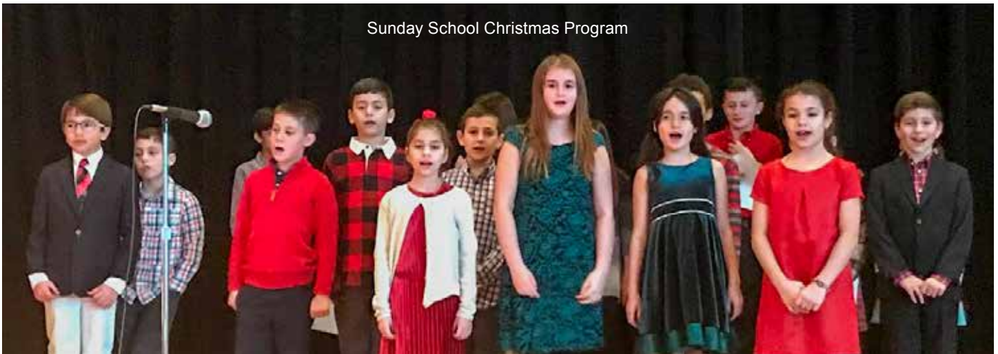
Sunday School Christmas Program

Our Outreach program is starting the new year by continuing to collect socks, food, and school supplies - thank you to all who have donated and please continue donating! We would also like to extend thanks to all who donated coats - over 100 were delivered, and the wreath sale was a huge success as well - we were able to raise a great amount to donate to our charities. ❖