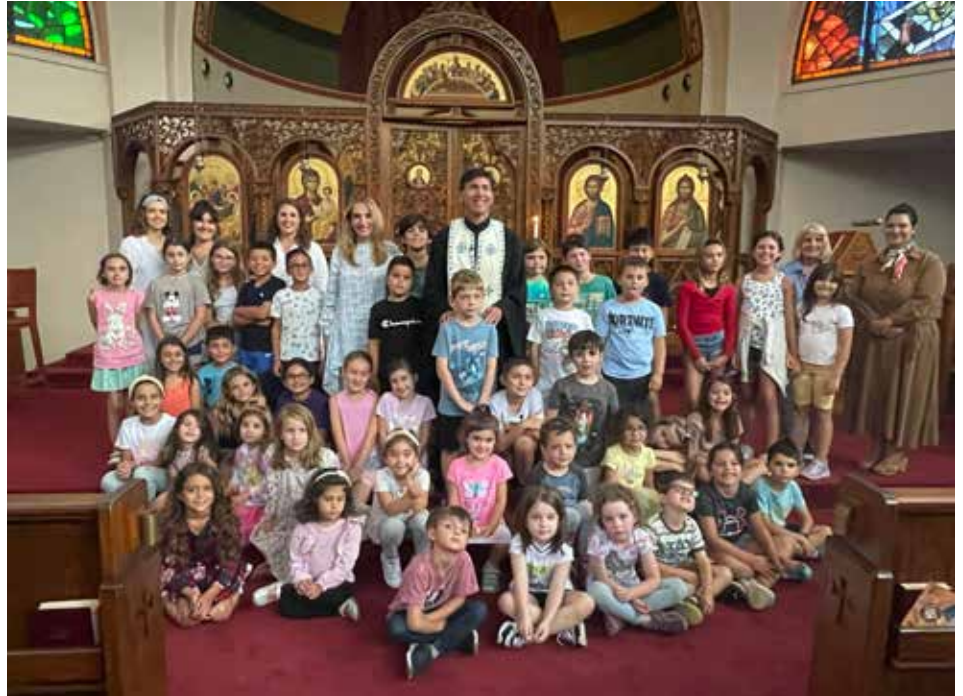
On Thursday, September 15 and Tuesday, September 20, Holy Trinity Greek School began with an Agiasmo Service in the church. We sanctify the beginning of the school year asking for divine protection and illumination for all the students and teachers.

September is the month that marks the beginning of a new school year for students and teachers. The beginning of each school year is always a challenge for every student and teacher for new knowledge and experiences. It is a moment of joy, optimism and increased expectations for the school season that begins. Therefore, at the beginning of the new, special school year, I wish, students, teachers and parents, to be effective allies in the struggle to master the knowledge of Greek, and at the same time, to safeguard the health of children and the whole of the community. I am certain that the educational community, despite the difficulties caused by the pandemic, will manage to function again this year as a tightknit unit transmitting love and interest for our Greece. I wish from the bottom of my heart, strength and perseverance, both to the students, our parents and teachers. Have a creative and fruitful school year, with health and success.