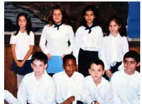
Young Giannis Atetokounmpo with his Sunday School class